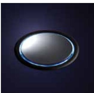
Nightlight effect Blue