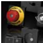
Pushbutton and switch modules