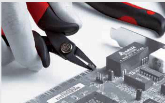
The Electronic long-nose pliers from Wiha hold small components and bend wires.

And all with an excellent quality and at a competitive price to which both professionals and demanding handymen will not be able to say no to.