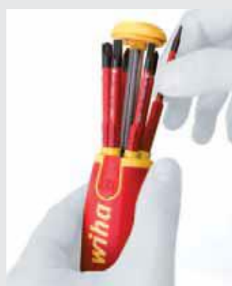
Each slimBit can be removed from the depot and re-inserted easily and conveniently

In addition to their main application in the electrical field, these bits can also be used for mechanical fastening.