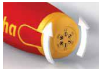
Turnable cap: Convenient way to add additional axial force