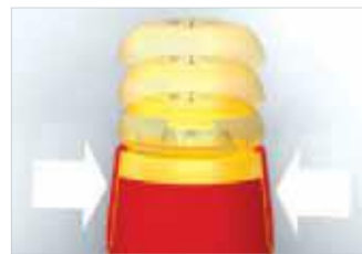
A clever solution: 2 rockers pressed simultaneously unlock the bit depot