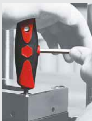
A tool that is a pleasure to use. Using the side blade for even greater torque, a supporting hand stabilises the handle and prevents the blade from slipping.