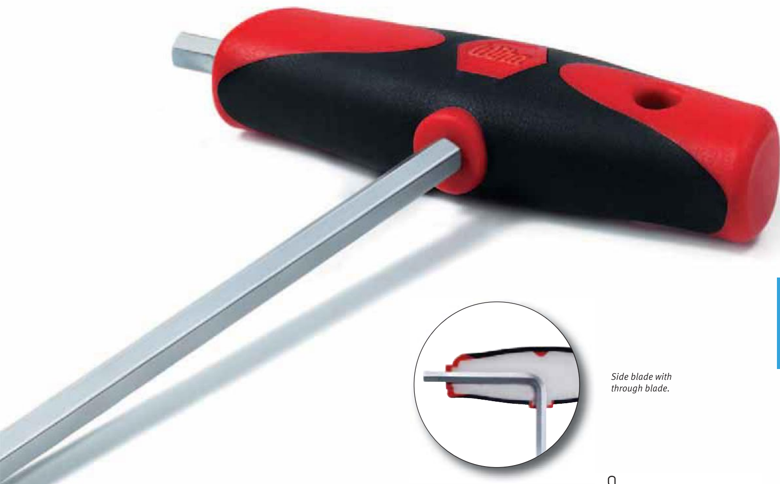
Side blade with through blade.

The new Wiha T-handle with through blade for additional side blade features soft zones for the comfortable transmission of high torques.