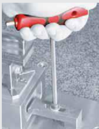
No screw can resist. The powerful Wiha ComfortGrip is quick and comfortable to use and even loosens screws that have been glued into position.

The hole in the handle can be used for shop storage.