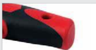
Black soft zones in the handle for comfortable working.