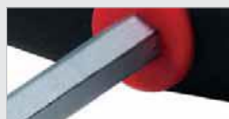
Chrome-plated blade for optimum corrosion protection.